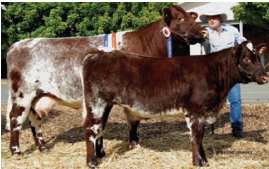
2008 SYDNEY ROYAL EASTER SHOW MALTON VI-WIN JANE 6TH, Grand Champion Beef Shorthorn Female RT&YE Falls & Sons – Finley NSW