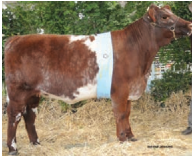
2011 ROYAL MELBOURNE SHOW MALTON PRINCESS BECKY, Grand Champion Australian Shorthorn Female RT&YE Falls & Sons – Finley, NSW