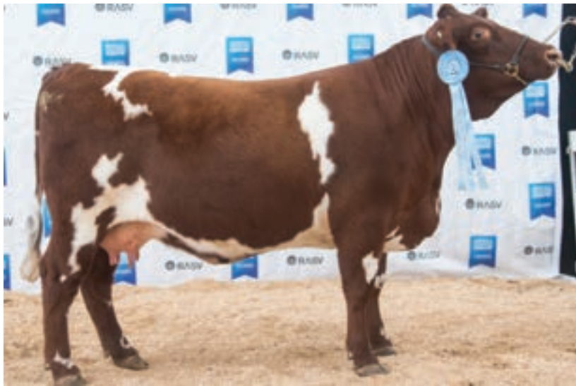
2018 ROYAL MELBOURNE SHOW MORNINGTIME KIRIBATI'S BLOSSOM 4 Grand Champion Beef Shorthorn Female D Ashley & Grandchildren – Camberwell, Victoria