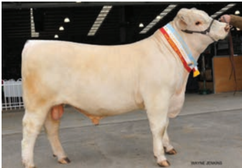
2015 ROYAL MELBOURNE SHOW SPENCER FAMILY KASPER Grand Champion Beef Shorthorn Bull Spencer Family – Yuroke, Victoria