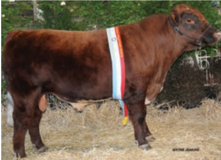
2012 ROYAL MELBOURNE SHOW HILLVIEW PISTOL, Grand Champion Beef Shorthorn Bull W&M Harwood – Streatham, Victoria