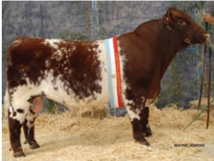
2008 ROYAL MELBOURNE SHOW MALTON COUGAR, Grand Champion Beef Shorthorn Bull RT&YE Falls & Sons – Finley NSW