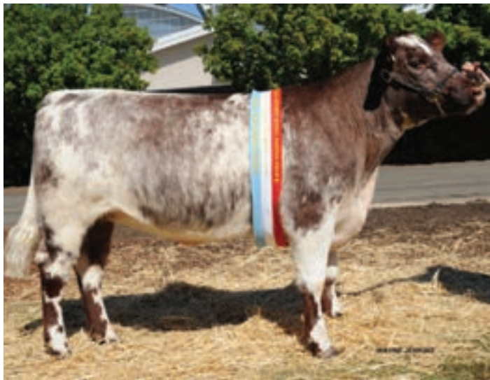
2013 SYDNEY ROYAL EASTER SHOW MORNINGTIME SOLDIER'S CHERRYWOOD, Grand Champion Beef Shorthorn Female D Ashley & Grandchildren – Camberwell, Victoria