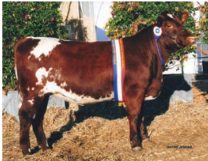
2011 SYDNEY ROYAL EASTER SHOW SPENCER FAMILY SUGAR PLUM, Grand Champion Beef Shorthorn Female Spencer Family – Yuroke, Victoria