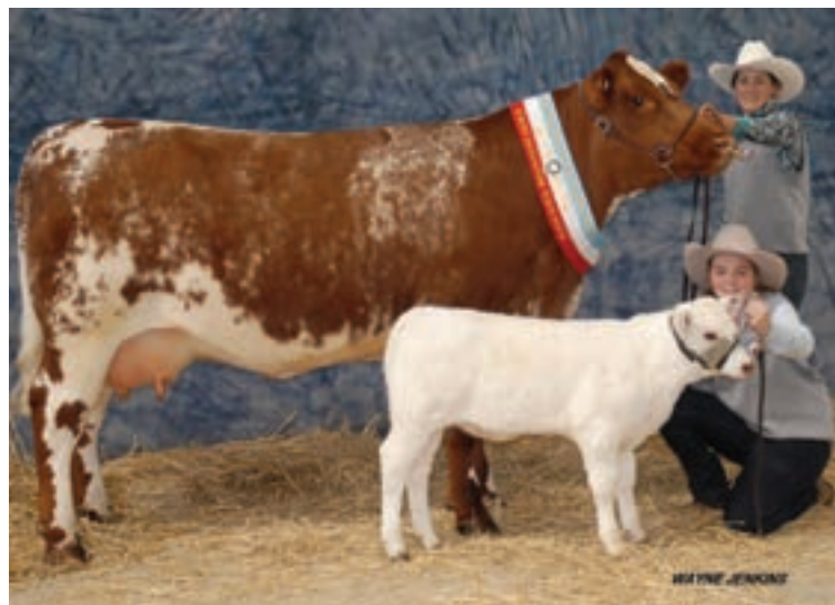
2014 ROYAL MELBOURNE SHOW SPENCER FAMILY COCO'S HONOUR LEGEND, Grand Champion Australian Shorthorn Female Spencer Family – Yuroke, Victoria