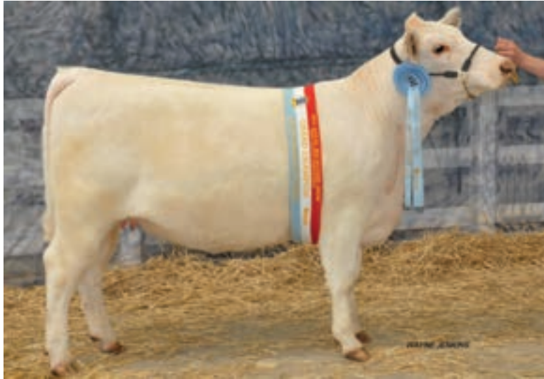
2015 ROYAL MELBOURNE SHOW MORNINGTIME SOLDIER'S BLOSSOM 38 Grand Champion Beef Shorthorn Female D Ashley & Grandchildren – Camberwell, Victoria