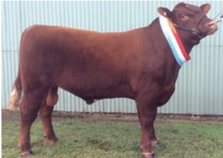
2016 ROYAL MELBOURNE SHOW SPENCER FAMILY LENNY Grand Champion Australian Shorthorn Bull Spencer Family – Yuroke, Victoria