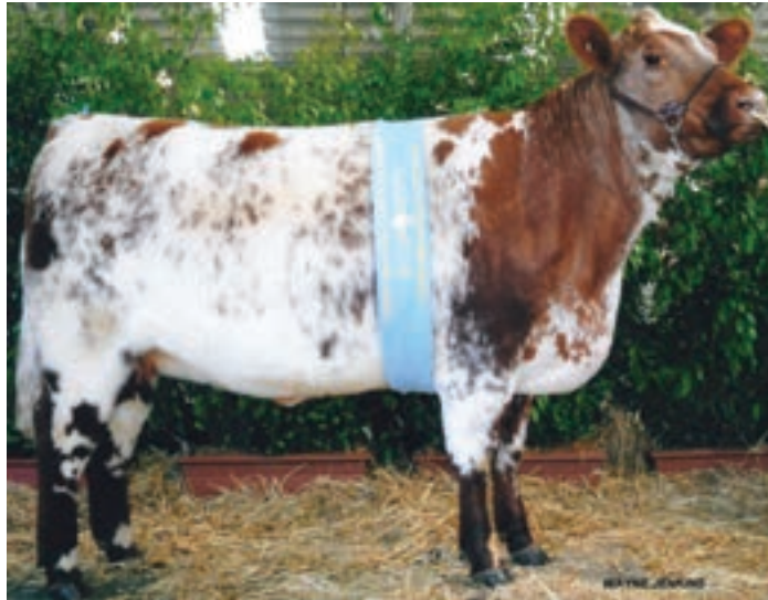
2009 ROYAL MELBOURNE SHOW SPENCER FAMILY COCO'S PINK FLOYD, Grand Champion Australian Shorthorn Female Spencer Family – Yuroke, Victoria