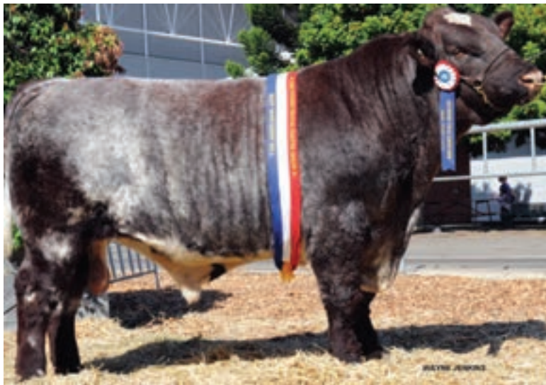
2010 SYDNEY ROYAL EASTER SHOW MALTON DIGGER, Grand Champion Beef Shorthorn Bull RT&YE Falls & Sons – Finley, NSW