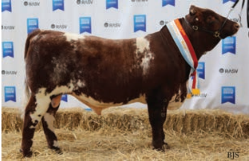
2017 ROYAL MELBOURNE SHOW SPENCER FAMILY MOSES Grand Champion Beef Shorthorn Bull Spencer Family – Yuroke, Victoria