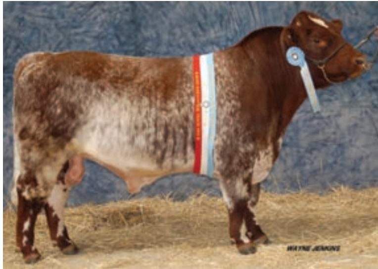
2014 ROYAL MELBOURNE SHOW MALTON IMPRESSIVE, Grand Champion Australian Shorthorn Bull RT&YE Falls & Sons – Finley, NSW