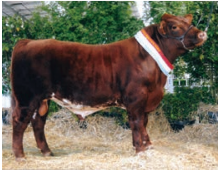
2011 ROYAL MELBOURNE SHOW SPENCER FAMILY WASABI, Grand Champion Australian Shorthorn Bull Spencer Family – Yuroke, Victoria