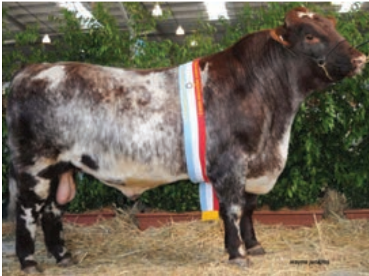
2010 ROYAL MELBOURNE SHOW MALTON ELDARADO, Grand Champion Beef Shorthorn Bull RT&YE Falls & Sons – Finley, NSW