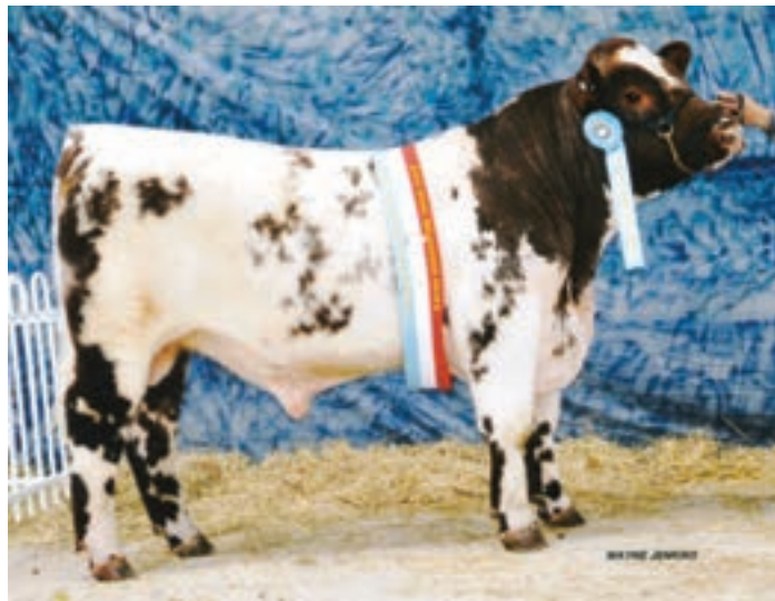
2013 ROYAL MELBOURNE SHOW MORNINGTIME KIRIBATI, Grand Champion Beef Shorthorn Bull D Ashley & Grandchildren – Camberwell, Victoria