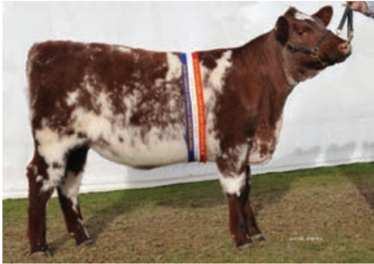
2015 ROYAL ADELAIDE SHOW ROLY PARK MISS AUSTRALIA Grand Champion Australian Shorthorn Female Mr S Bruton – Lake Boga, Victoria