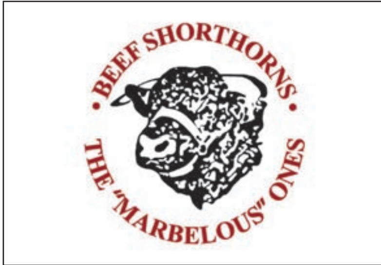
2009 ROYAL ADELAIDE SHOW HILLVIEW BLACKBERRY, Grand Champion Beef Shorthorn Female W&M Harwood, Streatham, Victoria