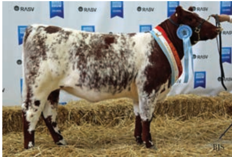
2017 ROYAL MELBOURNE SHOW ROLY PARK MAPLE Grand Champion Australian Shorthorn Female Mr S Bruton – Lake Boga, Victoria