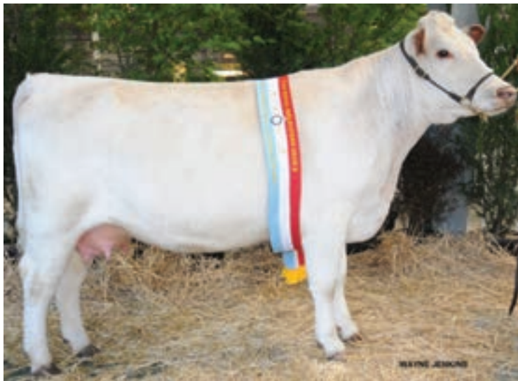
2012 ROYAL MELBOURNE SHOW HILLVIEW LAND LADY 2nd, Grand Champion Beef Shorthorn Female W&M Harwood – Streatham, Victoria