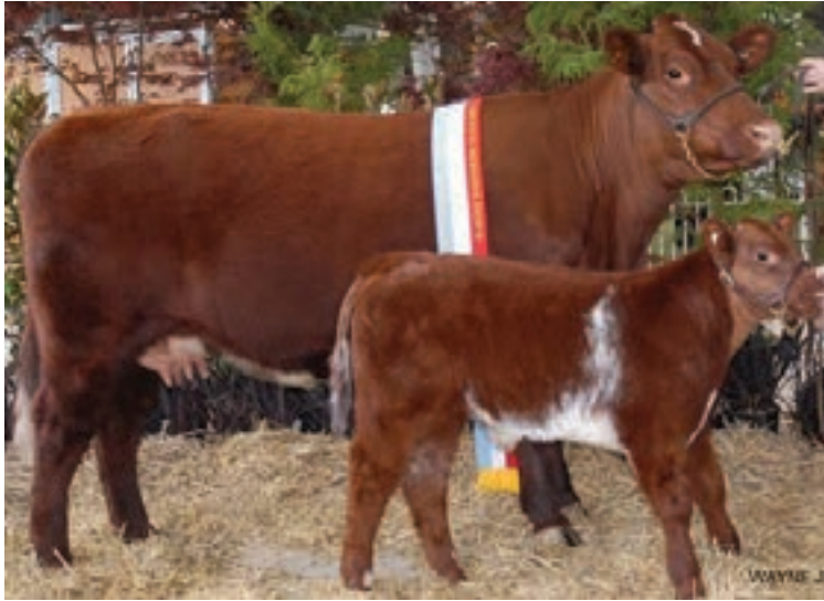
2009 ROYAL MELBOURNE SHOW MALTON BROADHOOKS VELVET ALICIA, Grand Champion Beef Shorthorn Female RT&YE Falls & Sons – Finley, NSW