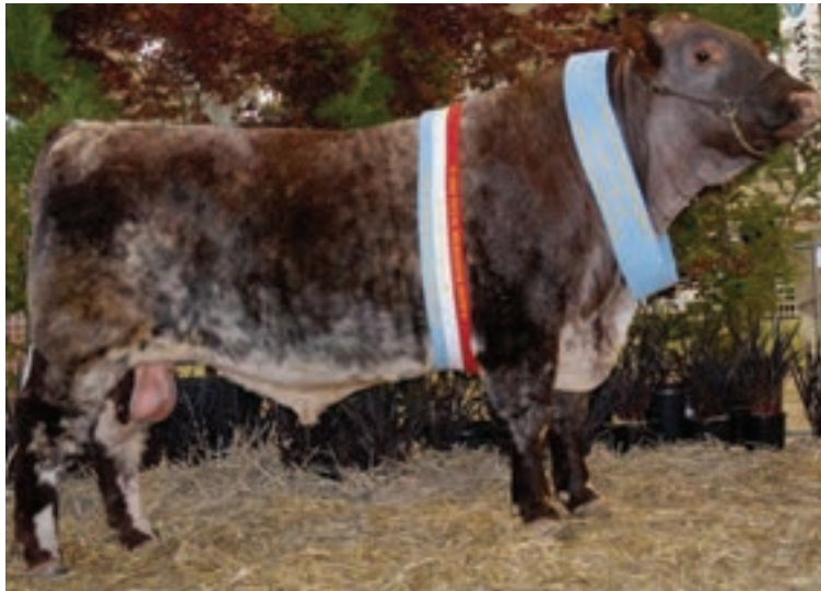
2009 ROYAL MELBOURNE SHOW MALTON DUSTER, Grand Champion Beef Shorthorn Bull RT&YE Falls & Sons – Finley NSW