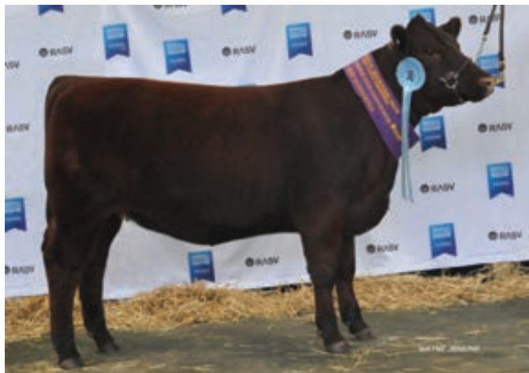
2016 ROYAL MELBOURNE SHOW SPENCER FAMILY DIVA Grand Champion Australian Shorthorn Female Spencer Family – Yuroke, Victoria