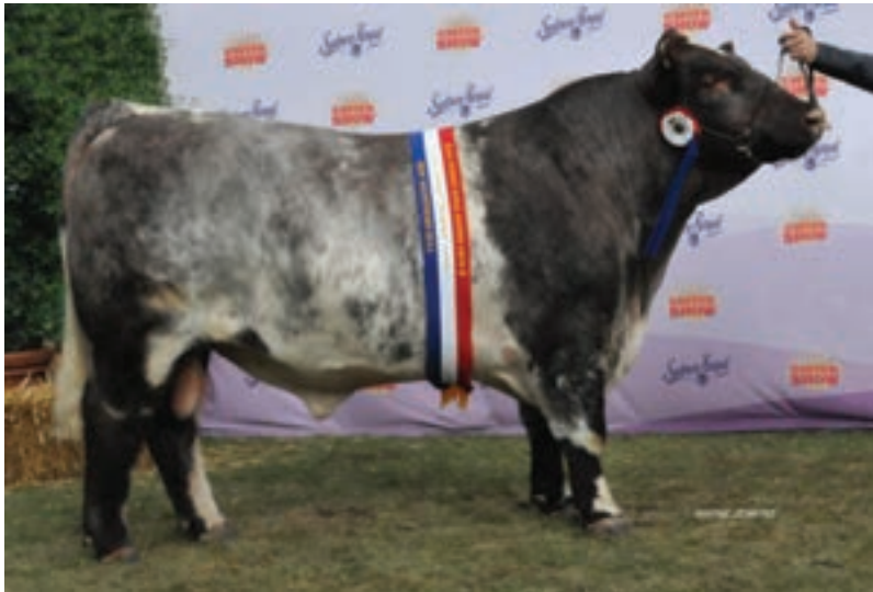
2017 SYDNEY ROYAL EASTER SHOW MORNINGTIME NARA Grand Champion Beef Shorthorn Bull D Ashley & Grandchildren – Camberwell, Victoria