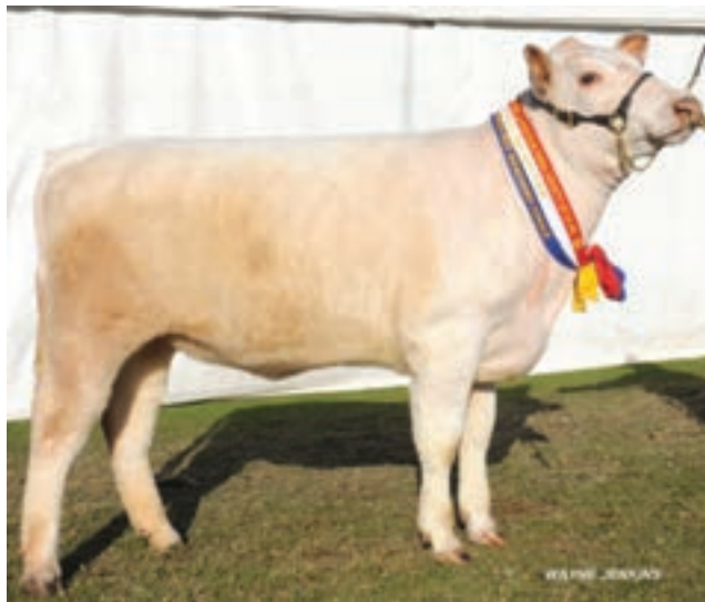
2012 ROYAL ADELAIDE SHOW ROLY PARK PEARL, Grand Champion Beef Shorthorn Female Mr S Bruton – Lake Boga, Victoria