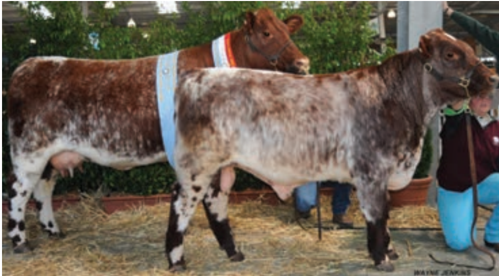
2010 ROYAL MELBOURNE SHOW MALTON PANWIN AMANDA, Grand Champion Beef Shorthorn Female RT&YE Falls & Sons – Finley, NSW