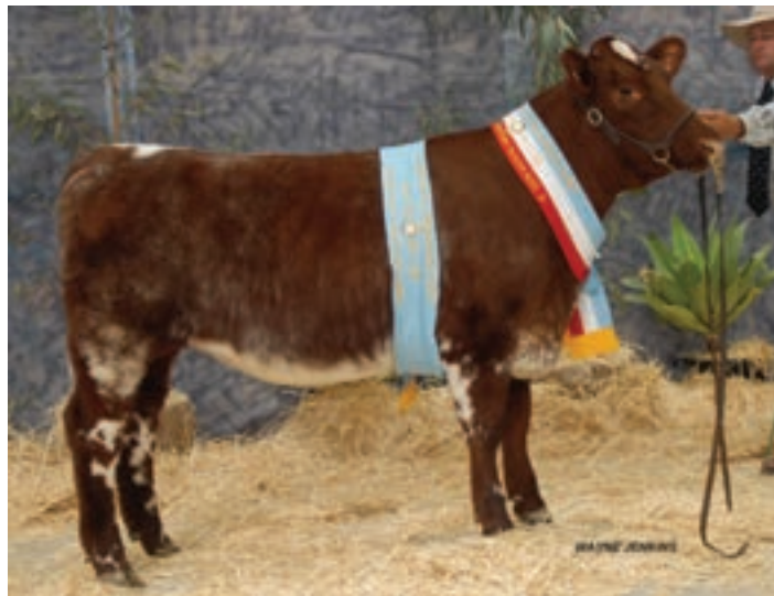
2008 ROYAL MELBOURNE SHOW MALTON VI WIN FELICITY, Grand Champion Beef Shorthorn Female RT&YE Falls & Sons – Finley NSW