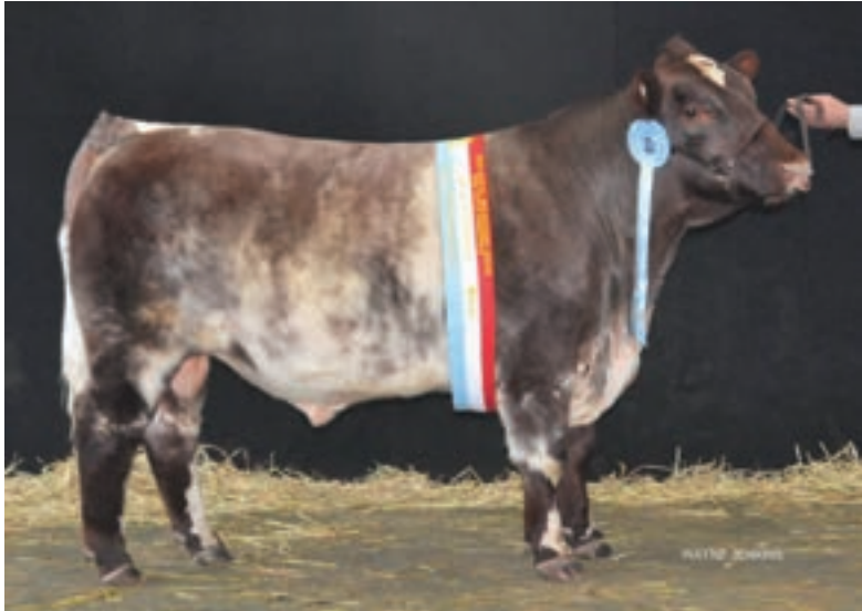
2016 ROYAL MELBOURNE SHOW MORNINGTIME NARA Grand Champion Beef Shorthorn Bull D Ashley & Grandchildren – Camberwell, Victoria