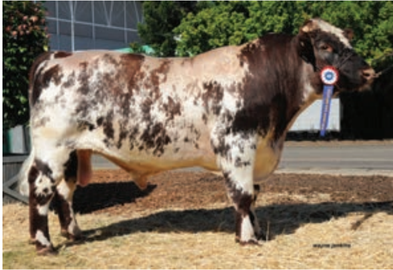
2013 SYDNEY ROYAL EASTER SHOW SPENCER FAMILY ARCHER, Grand Champion Beef Shorthorn Bull Spencer Family – Yuroke, Victoria