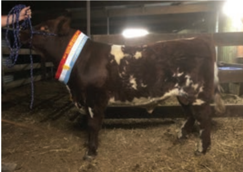
2018 ROYAL MELBOURNE SHOW SPENCER FAMILY NITRO Grand Champion Beef Shorthorn Bull Spencer Family – Yuroke, Victoria