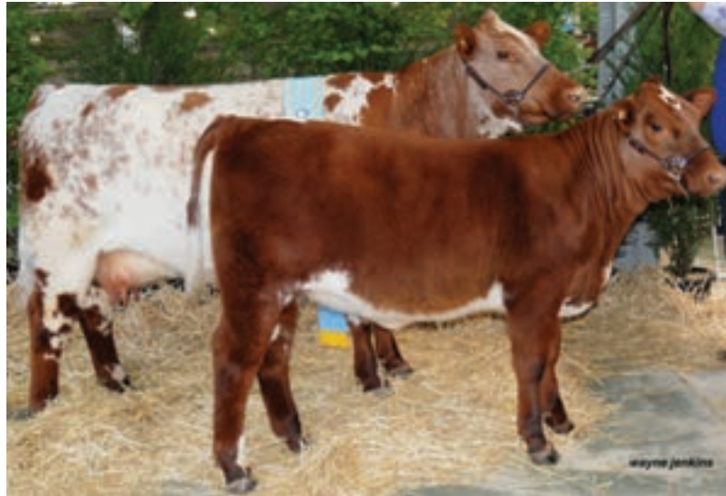
2010 ROYAL MELBOURNE SHOW SPENCER FAMILY COCO'S PINK FLOYD, Grand Champion Australian Shorthorn Female Spencer Family – Yuroke, Victoria