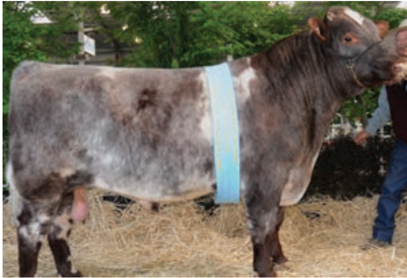
2012 ROYAL MELBOURNE SHOW MALTON HIGH ROLLER, Grand Champion Australian Shorthorn Bull RT&YE Falls & Sons – Finley, NSW