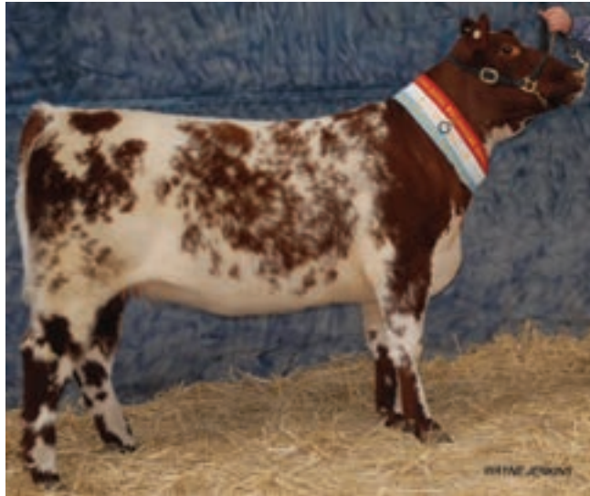
2014 ROYAL MELBOURNE SHOW MORNINGTIME SOLDIER'S BLOSSOM 32, Grand Champion Beef Shorthorn Female D Ashley & Grandchildren – Camberwell, Victoria