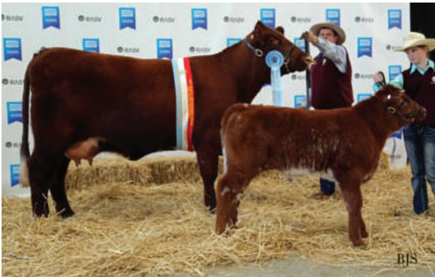
2017 ROYAL MELBOURNE SHOW ROLY PARK MILK LASSIE Grand Champion Beef Shorthorn Female Mr S Bruton – Lake Boga, Victoria