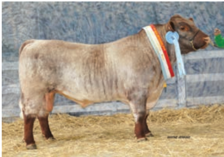
2015 ROYAL MELBOURNE SHOW MALTON JACKSON Grand Champion Australian Shorthorn Bull RT&YE Falls & Sons – Finley, NSW