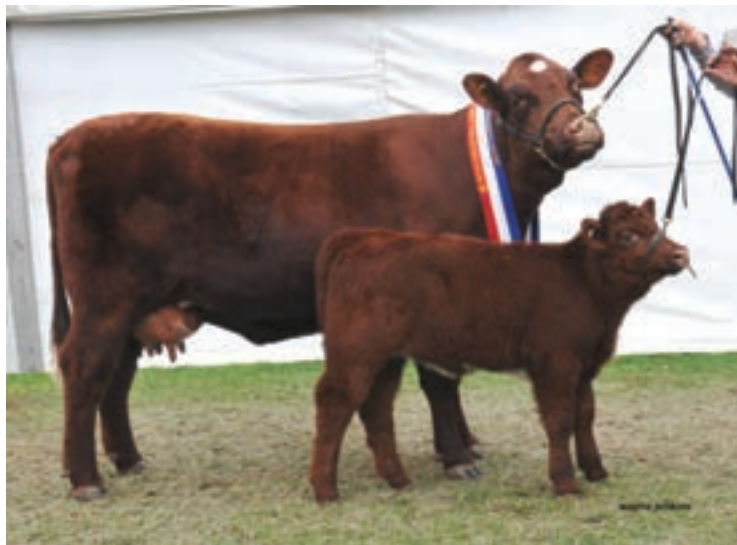
2013 ROYAL ADELAIDE SHOW ROLY PARK BELLA, Grand Champion Australian Shorthorn Female Mr S Bruton – Lake Boga, Victoria