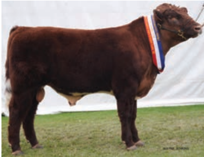
2011 ROYAL ADELAIDE SHOW HILLVIEW PISTOL, Grand Champion Beef Shorthorn Bull W&M Harwood – Streatham, Victoria