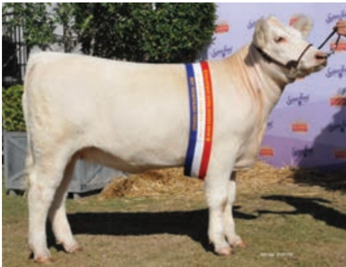
2015 SYDNEY ROYAL EASTER SHOW MORNINGTIME KIRIBATI'S BLOSSOM 2 Grand Champion Beef Shorthorn Female D Ashley & Grandchildren – Camberwell, Victoria