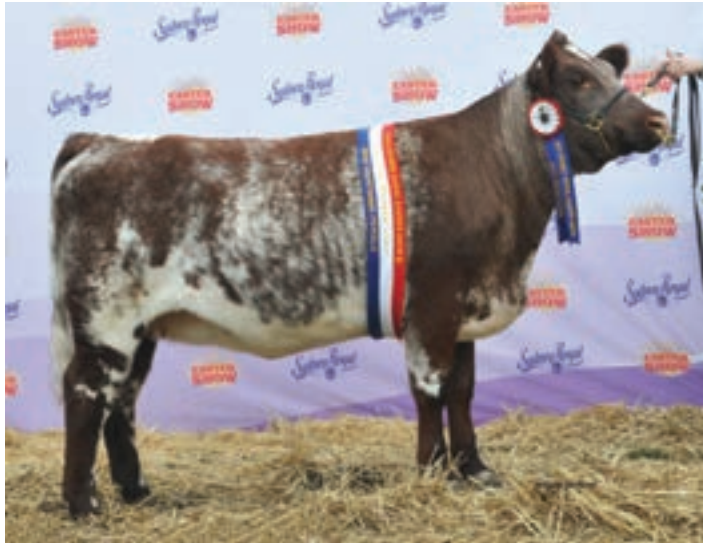
2014 SYDNEY ROYAL EASTER SHOW MORNINGTIME SOLDIER'S BLOSSOM 26, Grand Champion Beef Shorthorn Female D Ashley & Grandchildren – Camberwell, Victoria