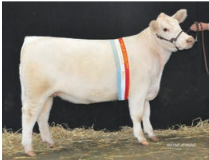
2016 ROYAL MELBOURNE SHOW MORNINGTIME KIRIBATI'S BLOSSOM 2 Grand Champion Beef Shorthorn Female D Ashley & Grandchildren – Camberwell, Victoria