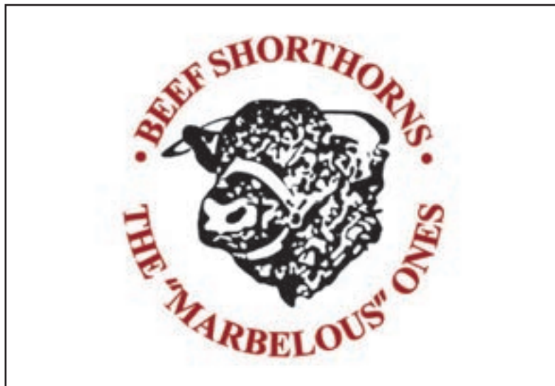
2007 NATIONAL BEEF BENDIGO MALTON A-GRADE SUPREME INTERBREED EXHIBIT RT&YE FALLS & SONS – Finley, NSW