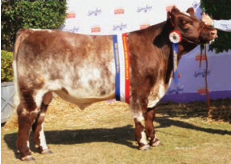
2015 SYDNEY ROYAL EASTER SHOW MORNINGTIME NARA Grand Champion Beef Shorthorn Bull D Ashley & Grandchildren – Camberwell, Victoria