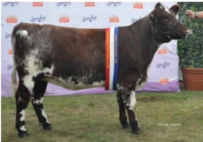
2017 SYDNEY ROYAL EASTER SHOW SPENCER FAMILY FULLA BEANS Grand Champion Beef Shorthorn Female Spencer Family – Yuroke, Victoria