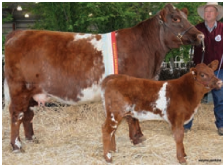
2012 ROYAL MELBOURNE SHOW MALTON PRINCESS BECKY, Grand Champion Australian Shorthorn Female RT&YE Falls & Sons – Finley, NSW