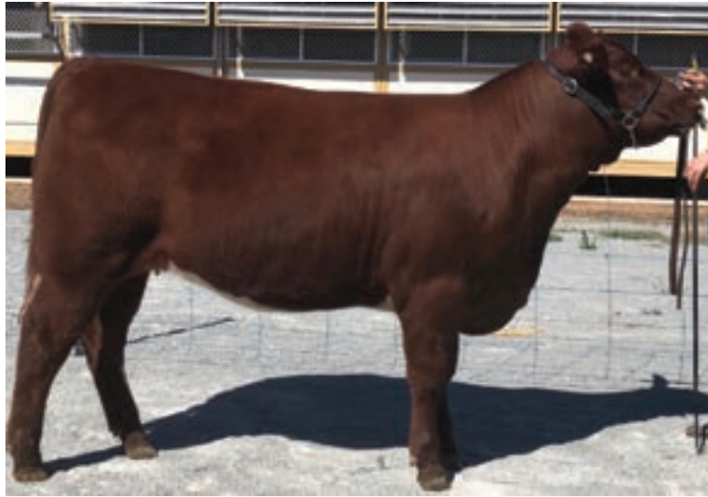
2018 ROYAL MELBOURNE SHOW SPENCER FAMILY MULENOR ROSE ROYCE Grand Champion Australian Shorthorn Female Spencer Family – Yuroke, Victoria