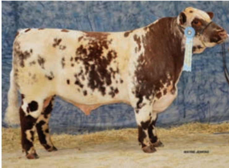
2013 ROYAL MELBOURNE SHOW SPENCER FAMILY YOGI, Grand Champion Australian Shorthorn Bull Spencer Family – Yuroke, Victoria