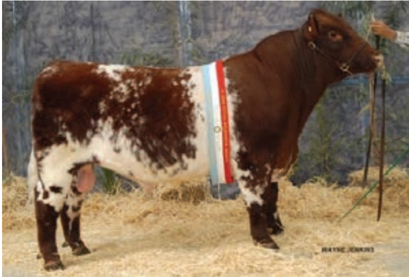
2008 ROYAL MELBOURNE SHOW MALTON COUGAR ALL BREEDS CHAMPION RT&YE Falls & Sons – Finley, NSW